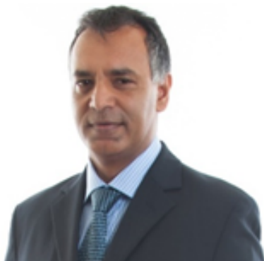
Moderator: Dr. Shabir Madhi University of the Witwatersrand

Vaccination rates for many diseases have been stalling, and COVID-19 has only exacerbated this problem by overwhelming healthcare workers and delaying non-emergency medical visits. From the United States to Africa , studies have shown that childhood vaccination has been disrupted by the pandemic. Vaccine uptake is an issue that extends far beyond COVID-19 vaccines and must be urgently addressed to ensure that preventable illness and death is mitigated.